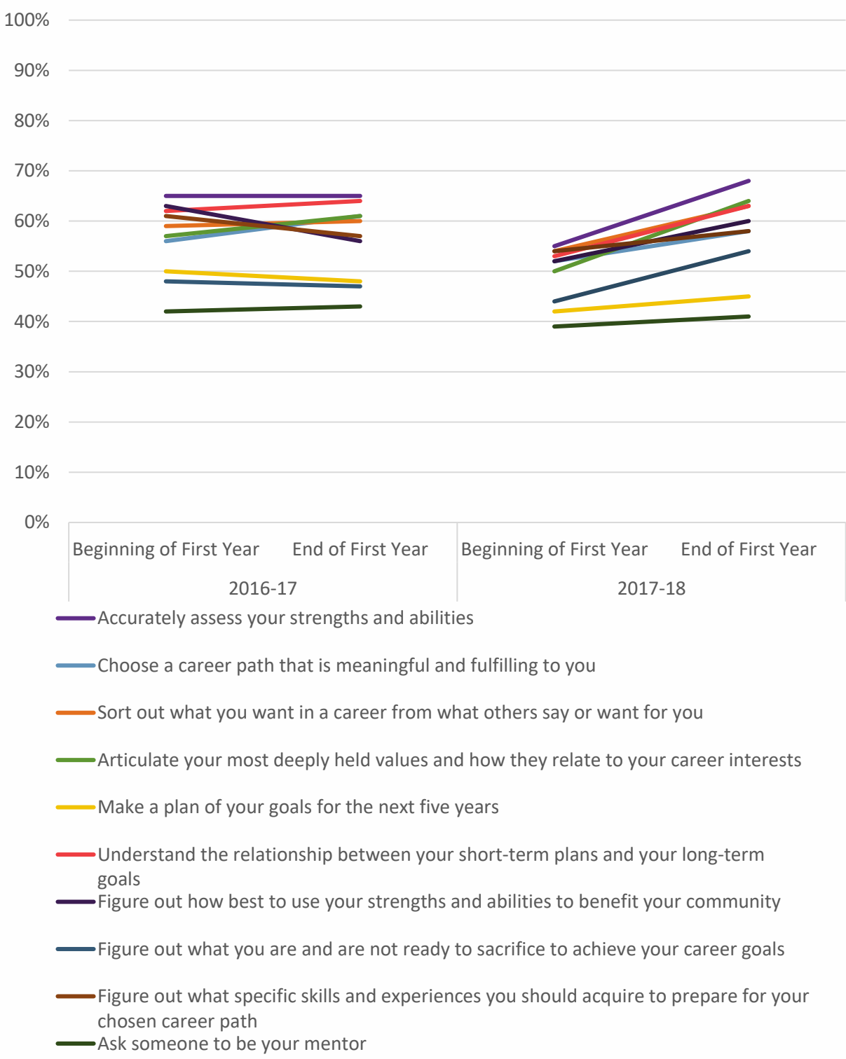
Figure 2: Percentage of Students Rating Themselves as having at least Much Confidence Across Different Vocare Skills Over Time