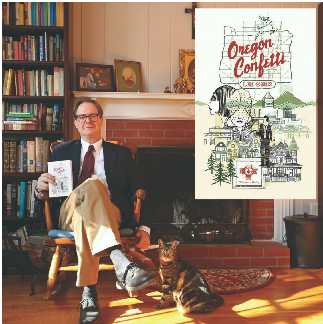
Authors on the Hill