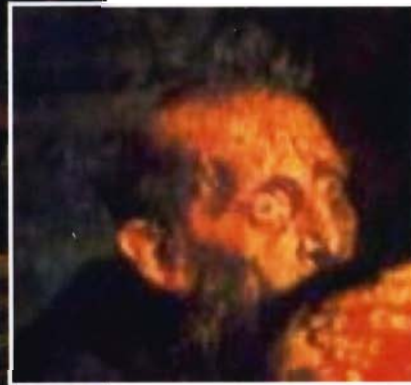
Ivan the Terrible and His Son Ivan: November 16, 1581 • Ilya Repin • 1885 • Tretyakov Gallery, Moscow

From classic Russian literature to current events in post-Soviet Russia, madness is an ubiquitous element of the Russian experience. We will cover a broad range of works—from medieval to post-Soviet masterpieces—to investigate the evolution of madness in Russian culture. The protagonists of the novels, plays, and short stories we will explore range from holy fools to everyday madmen to chronically troubled spirits. The reading will include Griboedov's The Trouble with Reason , Pushkin's Queen of Spades , Gogol's The Diary of a Madman , Dostoevsky's The Idiot , Chekhov's The Black Monk and Ward No 6 , Nabokov's The Defense , Bulgakov's The Master and Margarita , and Pelevin's Buddha's Little Fingers . We will also examine manifestations of fictional insanity in film, opera, and the visual arts.